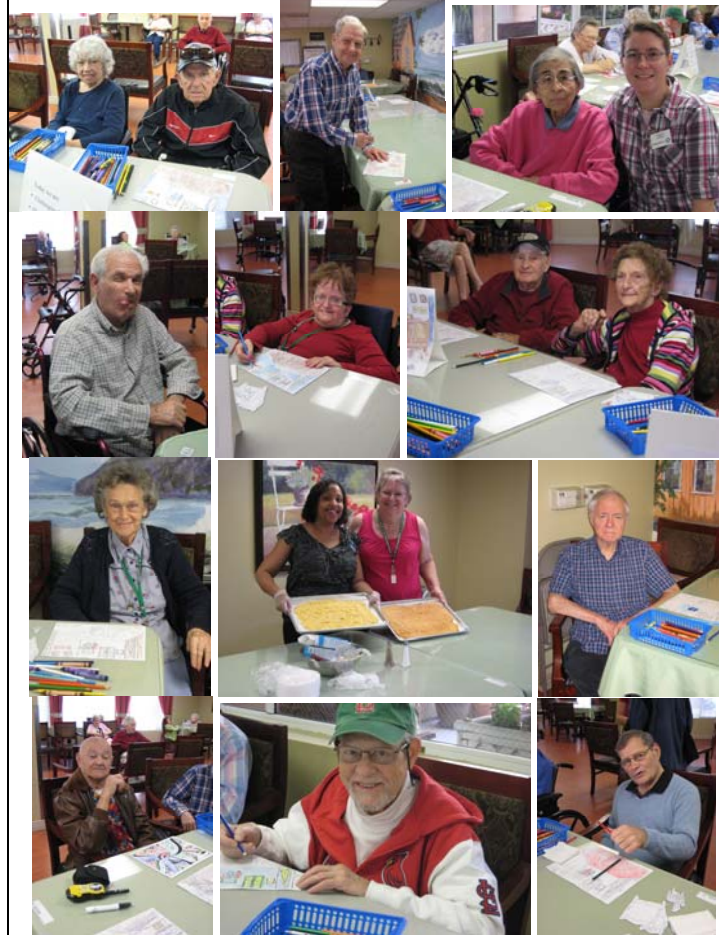
The Bella-of-the-Ball and friends